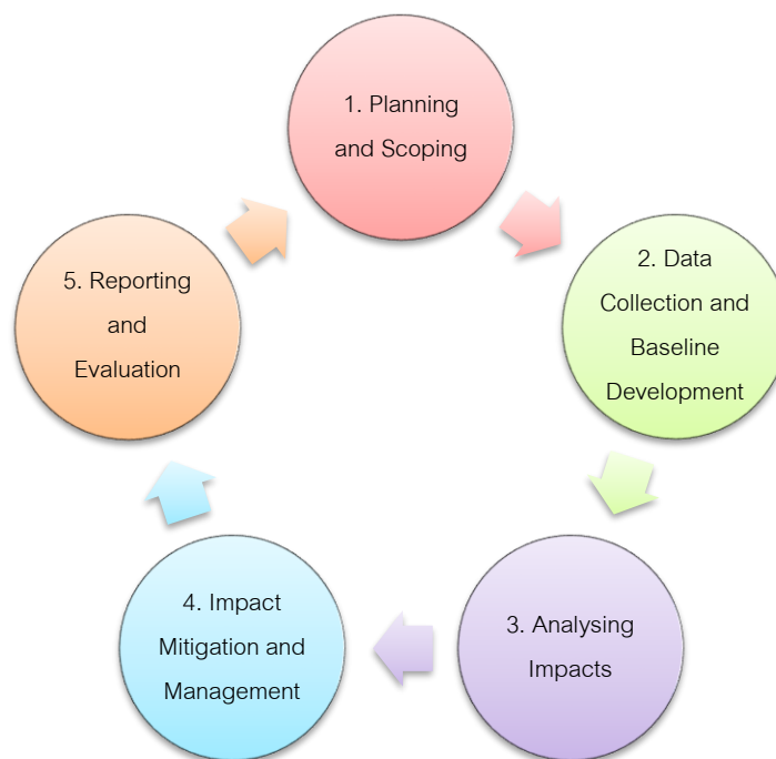
Figure 5.2 the Process of Human Rights Risk and Impact Assessment

The process of Human Rights Risk and Impact Assessment is presented in Figure 5.2.